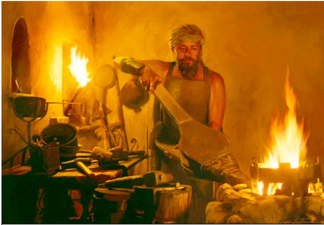
The Refiner's Fire

The idea that God is an angry figure who sends those He condemns to a place called Hell, where they spend eternity in torment separated from His presence, is missing from the Bible and unknown in the early church. While Heaven and Hell are decidedly real, they are experiential conditions rather than physical places, and both exist in the presence of God. In fact, nothing exists outside the presence of God.